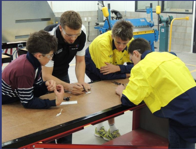
TTC – Mining Program