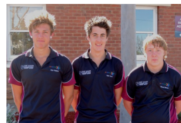
(Maroon/Navy polo shirt) $45.00

Industry Pathways uniforms are supplied free of charge to students accepted into the program. Replacement/spare shirts are at the expense of parents and caregivers.